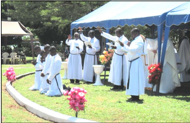
All asking God's blessings on the newly professed