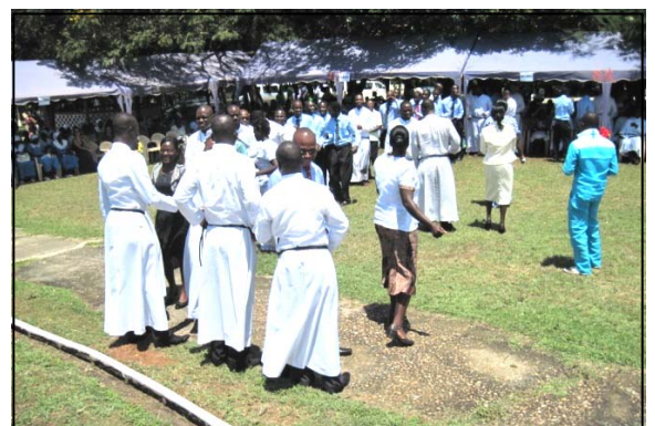
All congratulating the four newly professed

our four Holy Cross Novices. On this occasion that was held outside the St. Brother Andre Chapel there was given protection from rain and/or sun by an extensive outlay of canopies for the some 400 or more people there assembled. Fortunately, the heavy rains of the night before had ended and God providentially provided a bright and sunny day